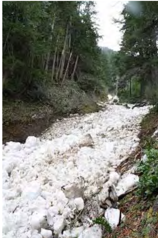
- Kevin Geraghty

I happened upon the old trail, marked by noticeable saw cuts, for maybe the